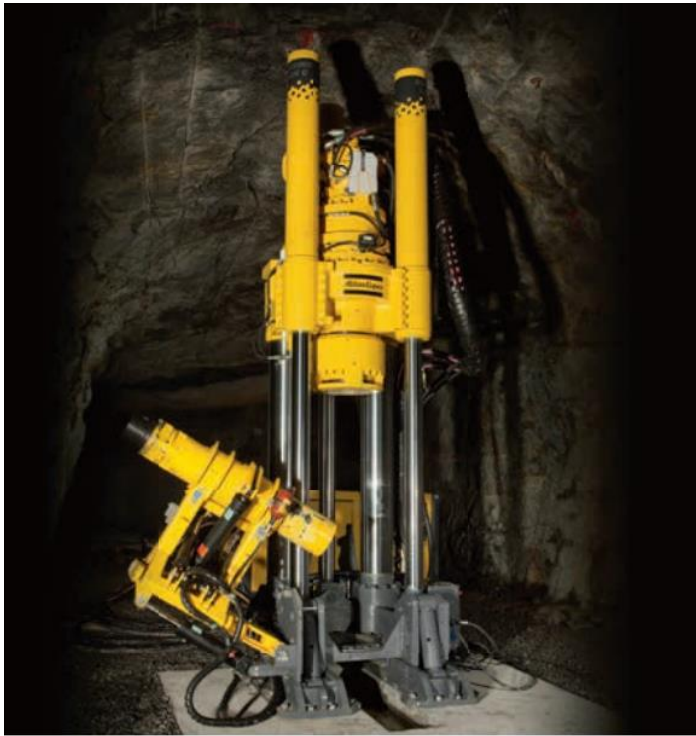
Robbins raiseborer used to drill service and personnel shafts, ore passes, stope openings and ventilation shafts.