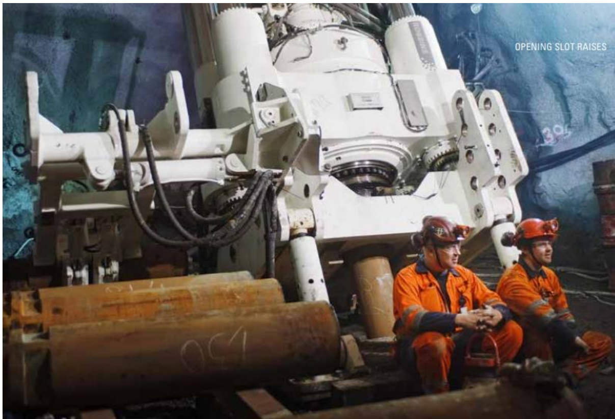
As in conventional raiseboring or boxhole drilling, the raiseboring machine is set up to drill a pilot hole vertically, upwards or downwards. The hole is then reamed to the required diameter. The cuttings fall down the raise and are deflected from the machine by the use of a muck collector and a muck chute.

physical presence of operators inside the void being opened are laborious and hazardous, and the current trend is to minimize the use of such methods. Today, modern mechanized equipment is available to create these all-important openings, making the job faster, simpler and, above all, much safer.