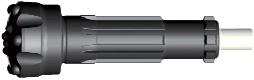
★ Specification Of Products : IR3.5