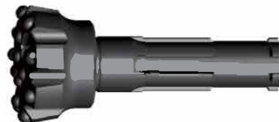
Specification Of Products : BR3