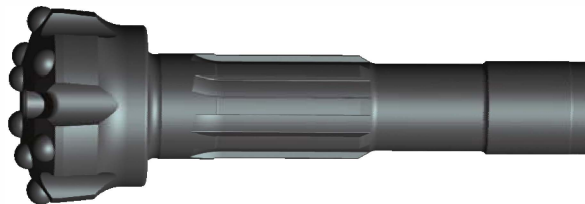
Specification Of Products : COP32