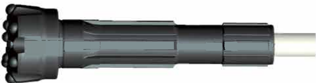
Specification Of Products : QL30, COP34